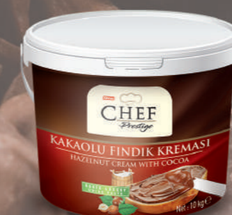
KAKOLU FINDIK KREMASI HAZELNUT CREAM WITH COCOA 10 Kg x Kova / 10 Kg Bucket 15 - 20 °C Sıcaklıkta / in 15 - 20 °C Temperature