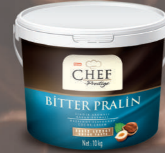
FINDIK AROMALI KAKAO KREMASI HAZELNUT FLAVOURED COCOA CREAM 10 Kg x Kova / 10 Kg Bucket 15 - 20 °C Sıcaklıkta / in 15 - 20 °C Temperature