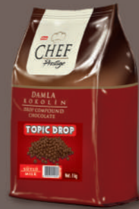
SÜTLÜ TOPİC DROP KOKOLİN MILKY DROP COMPOUND CHOCOLATE 1 Kg x 10 Poşet / 1 Kg x 10 Bag 15 - 20°C Sıcaklıkta / in 15 - 20°C Temperature