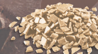
FİLDİŞİ PARÇA KOKOLİN 12MM / 23MM 47MM / 79MM(PARLAK) WHITE COMPOUND CHOCOLATE CHIPS 12MM / 23MM 47MM / 79MM(POLISHED) 3 Kg x 4 Koli / 3 Kg x 4 Box 15 - 20°C Sıcaklıkta / in 15 - 20°C Temperature