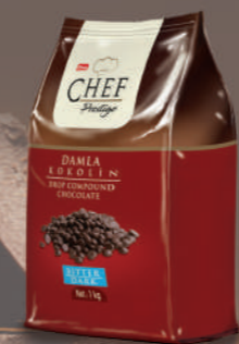
BİTTER DAMLA KOKOLİN DARK DROP COMPOUND CHOCOLATE 1 Kg x 10 Poşet / 1 Kg x 10 Bag 15 - 20°C Sıcaklıkta / in 15 - 20°C Temperature