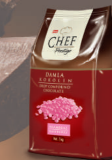
FRAMBUAZ DAMLA KOKOLİN RASPBERRY DROP COMPOUND CHOCOLATE 1 Kg x 10 Poşet / 1 Kg x 10 Bag 15 - 20°C Sıcaklıkta / in 15 - 20°C Temperature