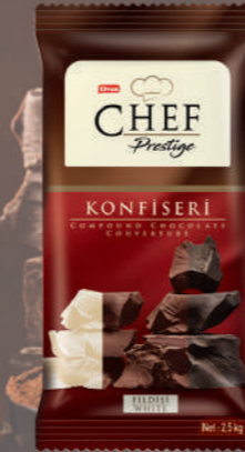
FİLDİŞİ KUVERTÜR KONFİSERİ WHITE COMPOUND CHOCOLATE COUVERTURE 2,5 Kg x 10 Blok / 2,5 Kg x 10 Block 15 - 20°C Sıcaklıkta / in 15 - 20°C Temperature