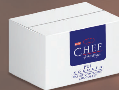
SÜTLÜ PUL KOKOLİN MILKY COMPOUND CHOCOLATE CALLETS 3 Kg x 4 Koli / 3 Kg x 4 Box 15 - 20°C Sıcaklıkta / in 15 - 20°C Temperature