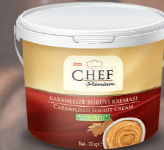
PREMIUM KAMELİZE BİSKÜVİ KREMASI CARAMELIZED BISCUIT CREAM 10 Kg x Kova / 10 Kg Bucket 15 - 20 °C Sıcaklıkta / in 15 - 20 °C Temperature