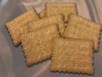
PREMIUM PETIT BEURRE BİSKÜVİ PREMIUM PETIT BEURRE BISCUIT 6 Kg x 1 Koli / 6 Kg x 1 Box 15 - 20 °C Sıcaklıkta / in 15 - 20 °C Temperature