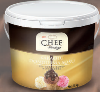
KAKAOLU DONDURMA SOSU ICE CREAM SAUCE WITH COCOA 10 Kg x Kova / 10 Kg Bucket 15 - 20 °C Sıcaklıkta / in 15 - 20 °C Temperature