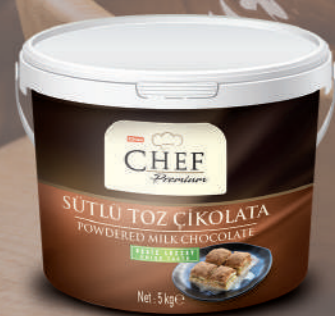
PREMIUM SÜTLÜ TOZ ÇİKOLATA PREMIUM MILK CHOCOLATE POWDER 5 Kg x 1 Kova / 5 Kg x 1 Bucket 15 - 20°C Sıcaklıkta / in 15 - 20°C Temperature