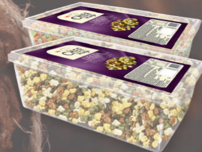
KOMANDO / PASTEL ÇAKIL TAŞI COMMANDO / PASTEL PEBBLE CHOCOLATE 1 Kg x 8 Kase / 1 Kg x 8 Plastic Box 250 gr x 36 Kase / 250 gr x 36 Plastic Box 15 - 20 °C Sıcaklıkta / in 15 - 20 °C Temperature