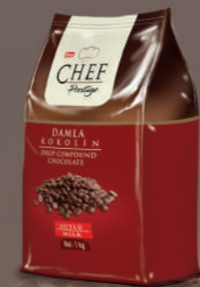
SÜTLÜ DAMLA KOKOLİN MILKY DROP COMPOUND CHOCOLATE 1 Kg x 10 Poşet / 1 Kg x 10 Bag 15 - 20°C Sıcaklıkta / in 15 - 20°C Temperature