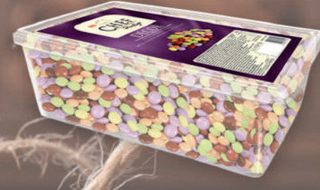
BONBON (KARİŞİK RENKLİ) (MINİ / MAXİ) BONBON (COLORFUL) (MINI / MAXI) MINİ 3 kg x 4 Kutu / 3 kg x 4 Box MAXİ 1 kg x 8 Kase / 1 kg x 8 Plastic Box 15 - 20 °C Sıcaklıkta / in 15 - 20 °C Temperature