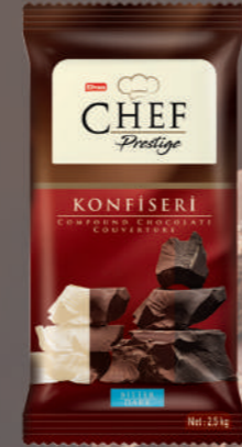
BİTTER KUVERTÜR KONFİSERİ DARK COMPOUND CHOCOLATE COUVERTURE 2,5 Kg x 10 Blok / 2,5 Kg x 10 Block 15 - 20°C Sıcaklıkta / in 15 - 20°C Temperature