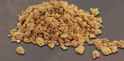
PREMIUM CAMELİZE BİSKÜVİ TOZU PREMIUM CARAMELIZED BISCUIT POWDER 10 Kg x 1 Koli / 10 Kg x 1 Box 15 - 20 °C Sıcaklıkta / in 15 - 20 °C Temperature