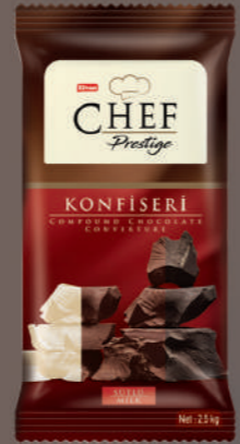
SÜTLÜ KUVERTÜR KONFİSERİ MILK COMPOUND CHOCOLATE COUVERTURE 2,5 Kg x 10 Blok / 2,5 Kg x 10 Block 15 - 20°C Sıcaklıkta / in 15 - 20°C Temperature