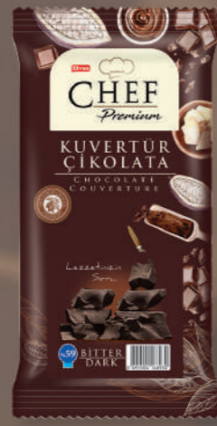
PREMIUM KUVERTÜR BİTTER ÇİKOLATA PREMIUM COUVERTURE DARK CHOCOLATE 2,5 Kg x 10 Flowpack / 2,5 Kg x 10 Flowpack 15 - 20°C Sıcaklıkta / in 15 - 20°C Temperature