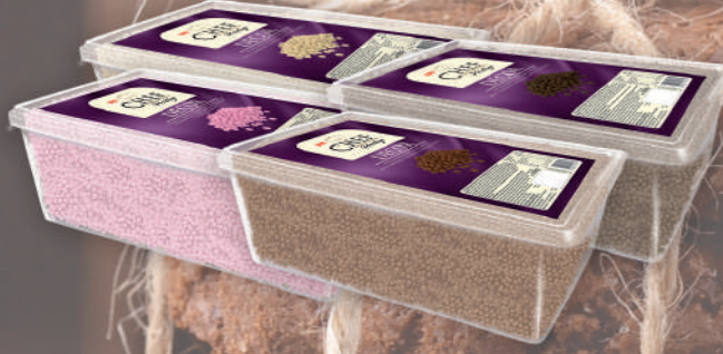
KONFİSERİ KAPLI PİRİNÇ PATLAĞI (SÜTLÜ / BİTER / FİLDİSİ /FRAMBUAZ) COMPOUND CHOCOLATE COVERED CRISPS (MILKY/ DARK / WHITE/RASPBERRY) 1 Kg x 8 Kase / 1 Kg x 8 Plastic Box 250 gr x 24 Kase / 250 gr x 24 Plastic Box 15 - 20 °C Sıcaklıkta / in 15 - 20 °C Temperature