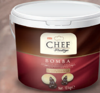
BOMBA KURABIYE DOLGU KREMASI COOKIE FILLING CREAM 10 Kg x Kova / 10 Kg Bucket 15 - 20 °C Sıcaklıkta / in 15 - 20 °C Temperature