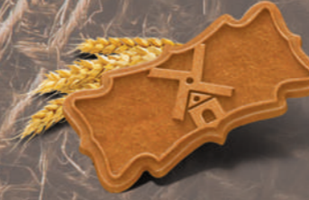
PREMIUM CAMELİZE BİSKÜVİ PET SEPERATOR PREMIUM CARAMEL BISCUIT PET SEPERATOR 320 gr x 10 Sp. / 320 gr x 10 Sp. 15 - 20 °C Sıcaklıkta / in 15 - 20 °C Temperature