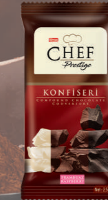
FRAMBUAZ KUVERTÜR KONFİSERİ RASPBERRY COMPOUND CHOCOLATE COUVERTURE 2,5 Kg x 10 Blok / 2,5 Kg x 10 Block 15 - 20°C Sıcaklıkta / in 15 - 20°C Temperature