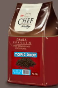
BİTTER TOPİC DROP KOKOLİN DARK DROP COMPOUND CHOCOLATE 1 Kg x 10 Poşet / 1 Kg x 10 Bag 15 - 20°C Sıcaklıkta / in 15 - 20°C Temperature