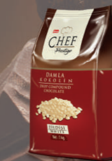
FİLDİŞİ DAMLA KOKOLİN WHITE DROP COMPOUND CHOCOLATE 1 Kg x 10 Poşet / 1 Kg x 10 Bag 15 - 20°C Sıcaklıkta / in 15 - 20°C Temperature