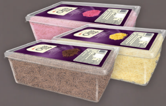
VERMİCELLİ (SARI / PEMBE / KAHVERENGİ) VERMICELLI (YELLOW / PINK / BROWN) 1 Kg x 8 Kase / 1 Kg x 8 Plastic Box 15 - 20 °C Sıcaklıkta / in 15 - 20 °C Temperature