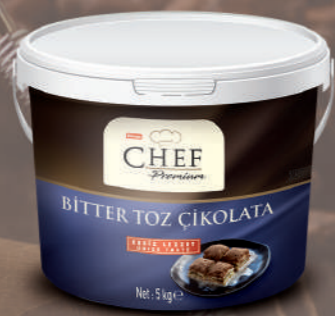
PREMIUM BİTTER TOZ ÇİKOLATA PREMIUM DARK CHOCOLATE POWDER 5 Kg x 1 Kova / 5 Kg x 1 Bucket 15 - 20°C Sıcaklıkta / in 15 - 20°C Temperature