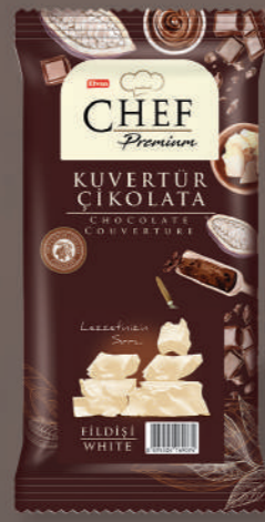
PREMIUM KUVERTÜR BEYAZ ÇİKOLATA PREMIUM COUVERTURE WHITE CHOCOLATE 2,5 Kg x 10 Flowpack / 2,5 Kg x 10 Flowpack 15 - 20°C Sıcaklıkta / in 15 - 20°C Temperature