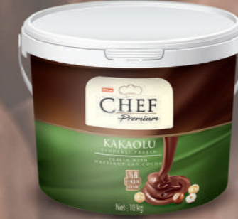
KAKAOLU FINDIKLI PRALİN PRALIN WITH HAZELNUT AND COCOA 10 Kg x Kova / 10 Kg Bucket 15 - 20 °C Sıcaklıkta / in 15 - 20 °C Temperature