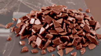
SÜTLÜ PARÇA KOKOLİN 12MM / 23MM 47MM / 79MM(PARLAK) MILKY COMPOUND CHOCOLATE CHIPS 12MM / 23MM 47MM / 79MM(POLISHED) 3 Kg x 4 Koli / 3 Kg x 4 Box 15 - 20°C Sıcaklıkta / in 15 - 20°C Temperature