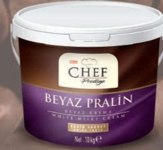
BEYAZ PRALİN WHITE PRALINE 10 Kg x Kova / 10 Kg Bucket 15 - 20 °C Sıcaklıkta / in 15 - 20 °C Temperature