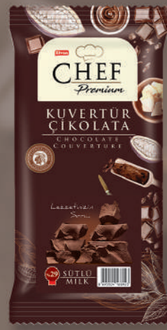
PREMIUM KUVERTÜR SÜTLÜ ÇİKOLATA PREMIUM COUVERTURE MILK CHOCOLATE 2,5 Kg x 10 Flowpack / 2,5 Kg x 10 Flowpack 15 - 20°C Sıcaklıkta / in 15 - 20°C Temperature